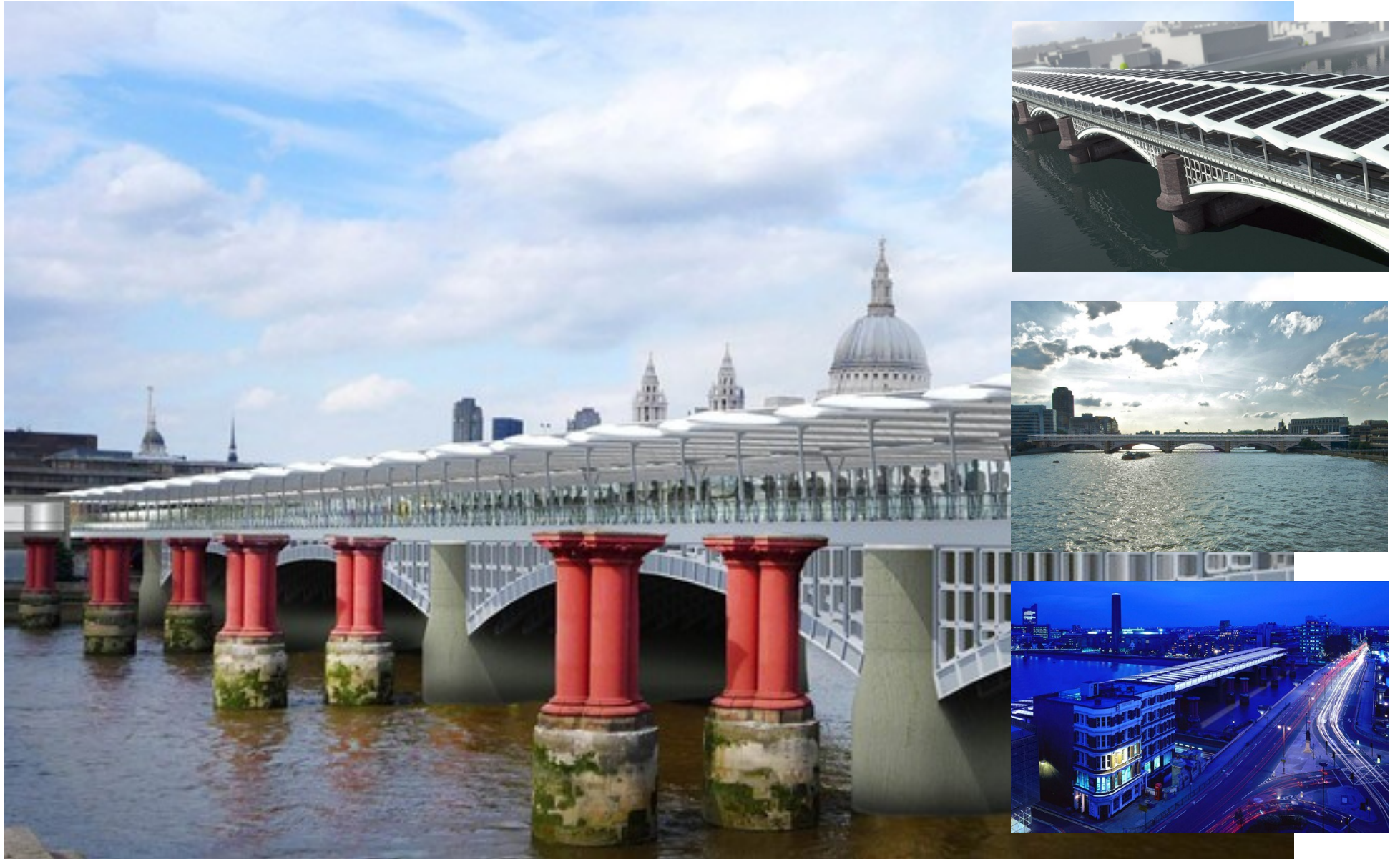
BLACKFRIARS STATION PLATFORM GLAZED SCREENS